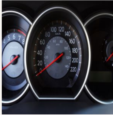
Accelerate and decelerate slowly