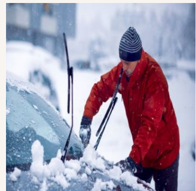
Stay with your vehicle if you get stuck in the snow