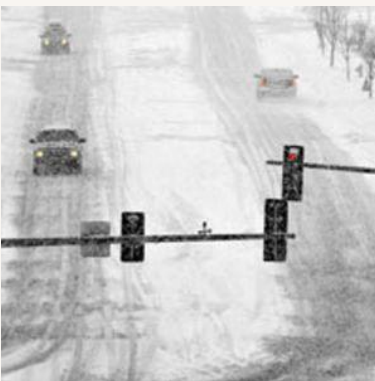
Check the weather before you leave for your destination