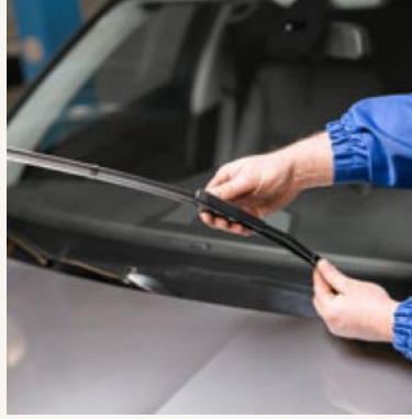
Winterize your car