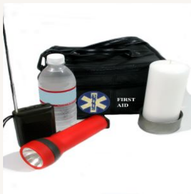
Keep an emergency kit in your car