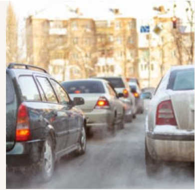
Increase your following distance